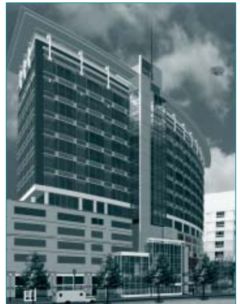
Architects: HLM Design, Philadelphia